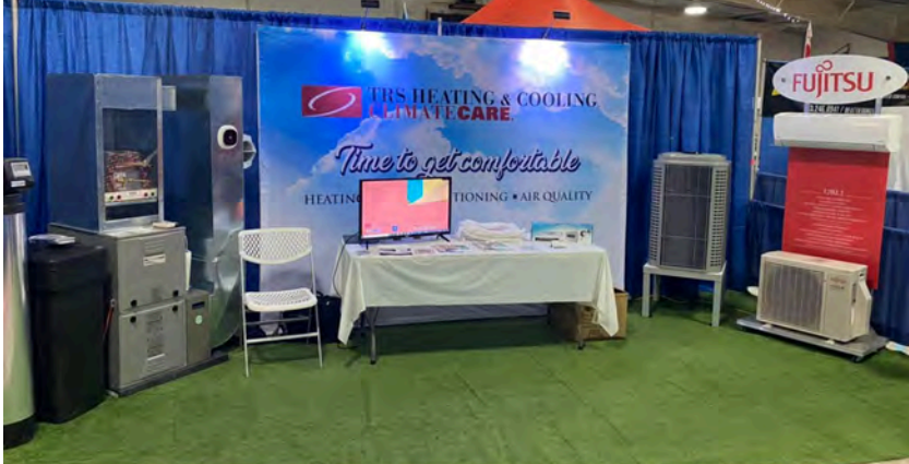
EXPANDED BOOTH ~ 20FT x 10FT