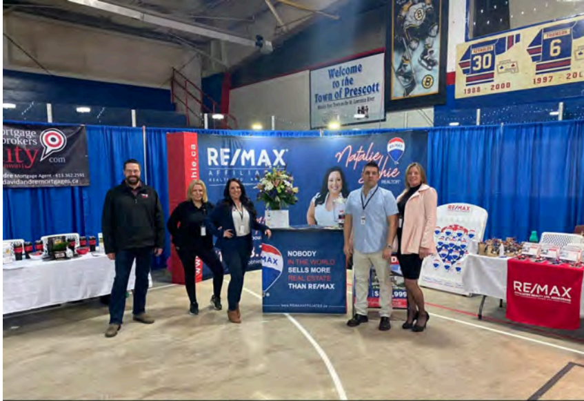
PREMIUM CORNER BOOTH ~ 34FT x 10FT