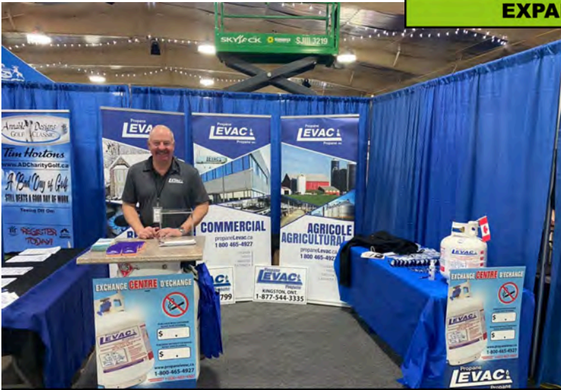
STANDARD BOOTH ~ 10FT x 10FT