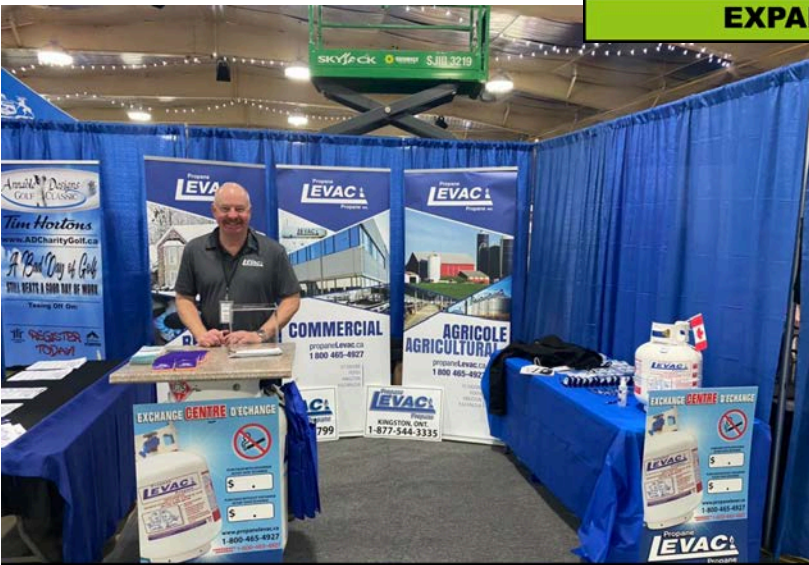
STANDARD BOOTH ~ 10FT x 10FT