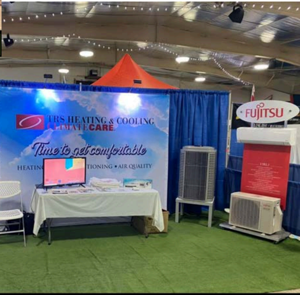
EXPANDED BOOTH ~ 20FT x 10FT