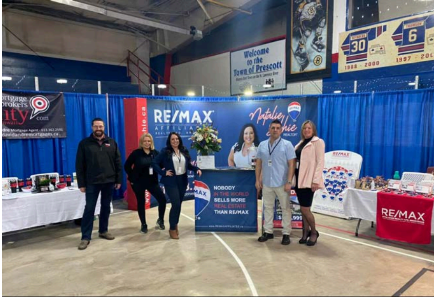
PREMIUM CORNER BOOTH ~ 34FT x 10FT