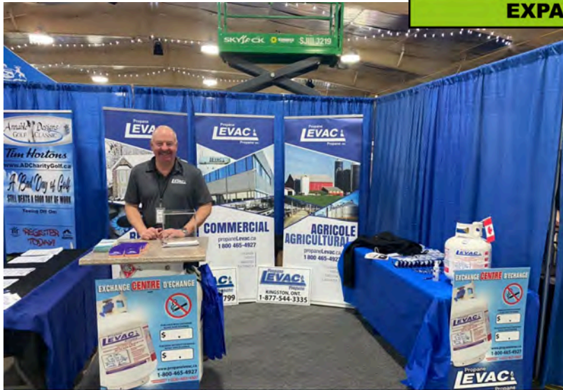
STANDARD BOOTH ~ 10FT x 10FT