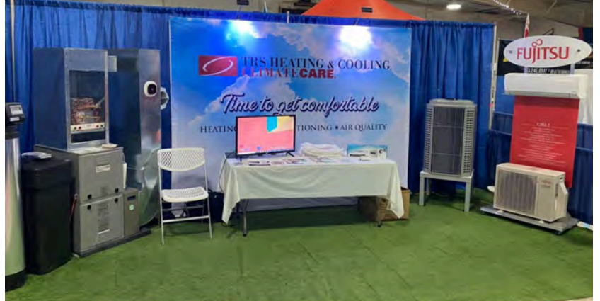
EXPANDED BOOTH ~ 20FT x 10FT