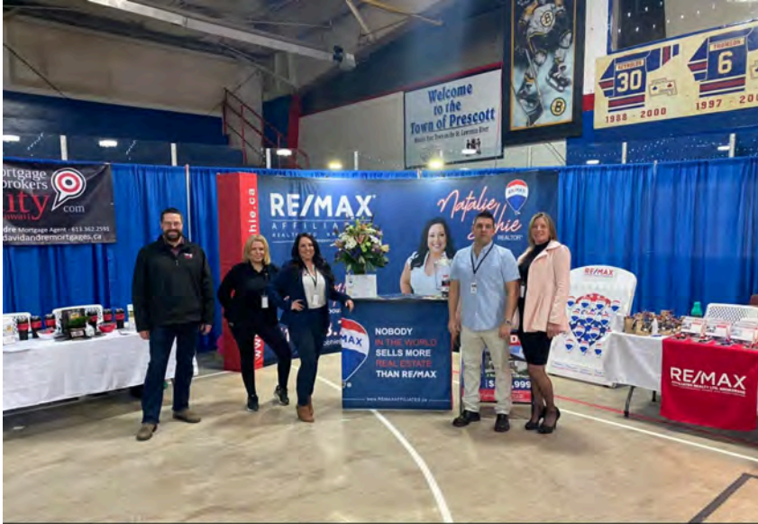
PREMIUM CORNER BOOTH ~ 34FT x 10FT